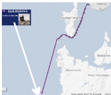
The whereabouts of Fair Winds after her Three Hummock departure