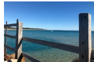
Fair Winds in perspective. Only a dot