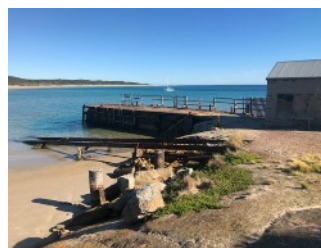
Three Hummock Jetty and boat shed