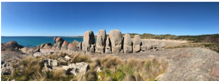
The five sisters of Three Hummock Island