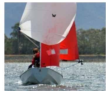
The face of the future CYAA