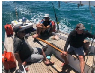
Just another day