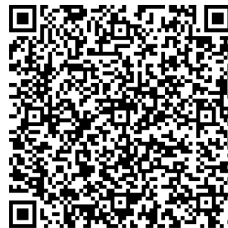
Race Two SIGN OFF After boat returns to home club