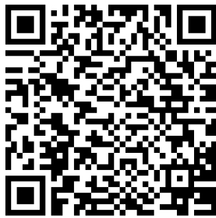
Race Two Personal SIGN IN

Contact details are stored for 30 days for use on subsequent sign in's