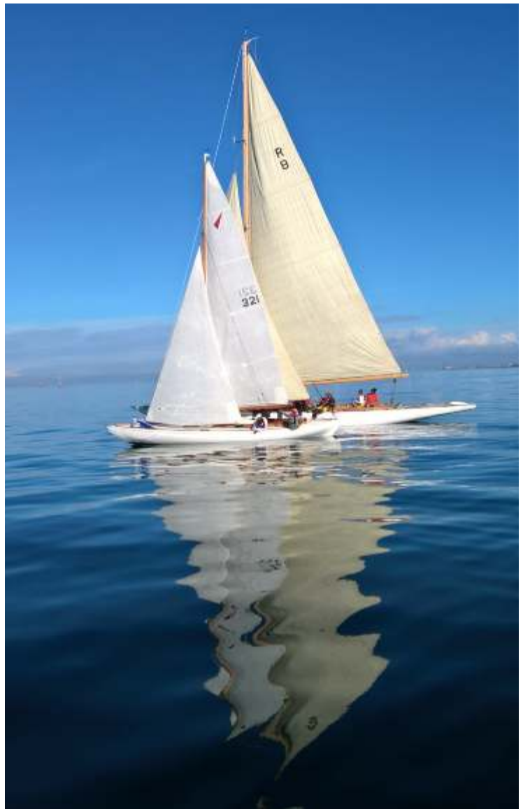
Frances overtaking Ettrick has Avian and RMYS Mark G in her sights