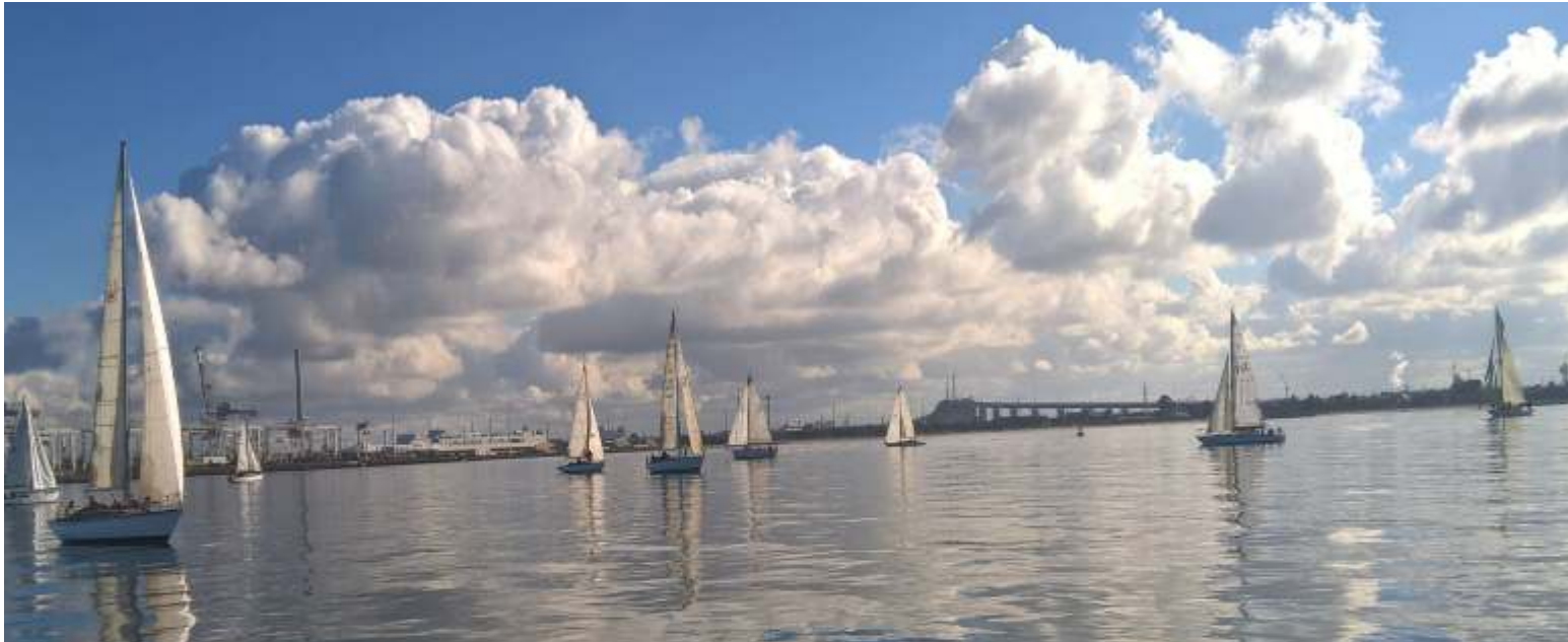
Boambillee preparing to sail under Marie Louise III. Snow Goose and Sayonara are to the right