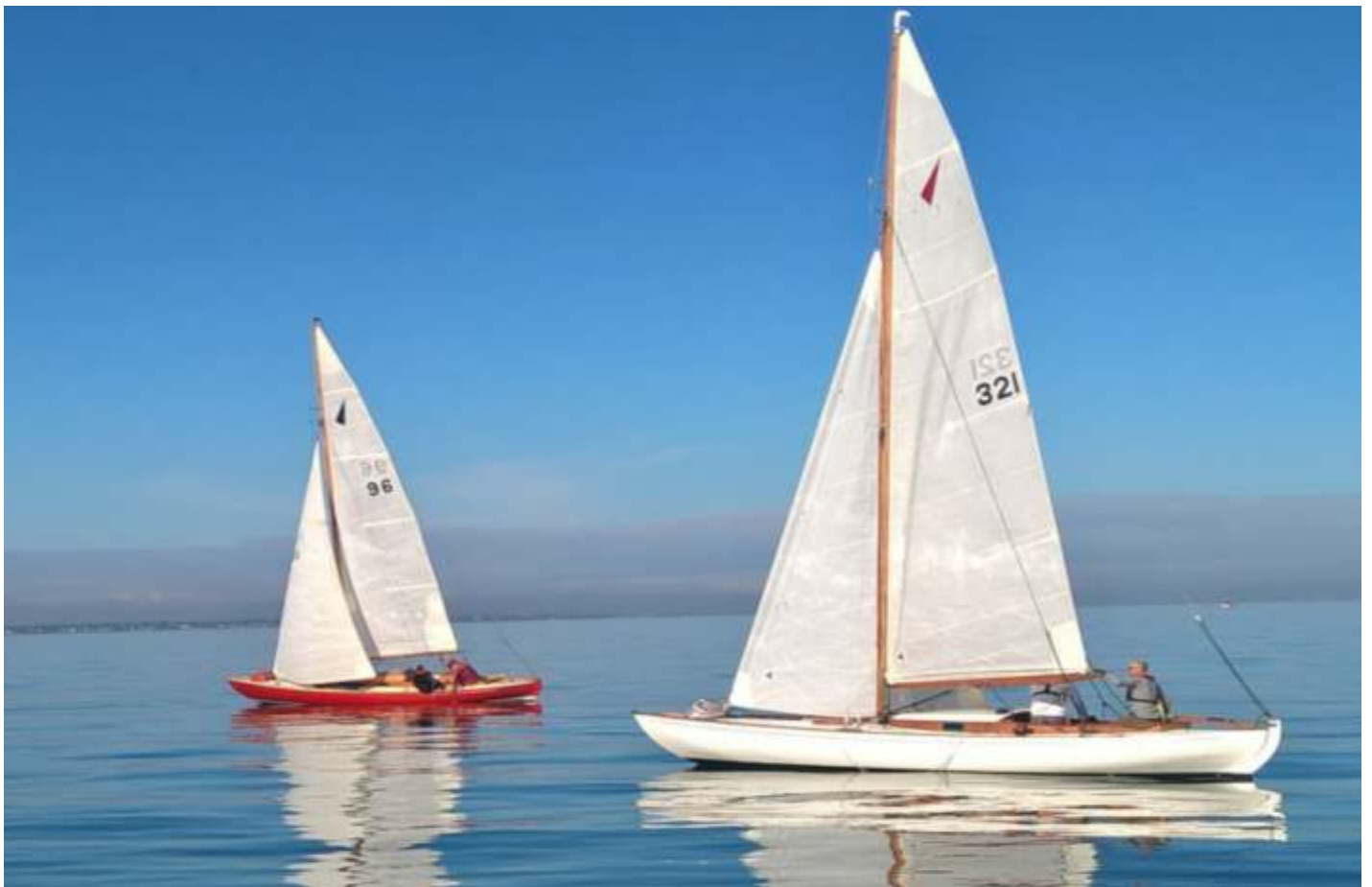
Avian holds off Etrick and leads the fleet to RMYS Mark G.

Avian had a close set to with remains of Princes Pier while Marie Louise III came of second best with her encounters with Bungoona and Kingurra . Fortunately no fishing on the end of Station Pier was the word from Marie Louise III . Light wind tactics saw fleet position gains by Dingo and Martini , Avian and Etrick continued their close together battle while on different tacks.