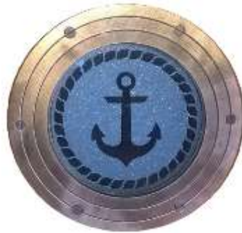
Foredeck hatch way skylight on 1904 cutter Janet under restoration by Greg Blunt