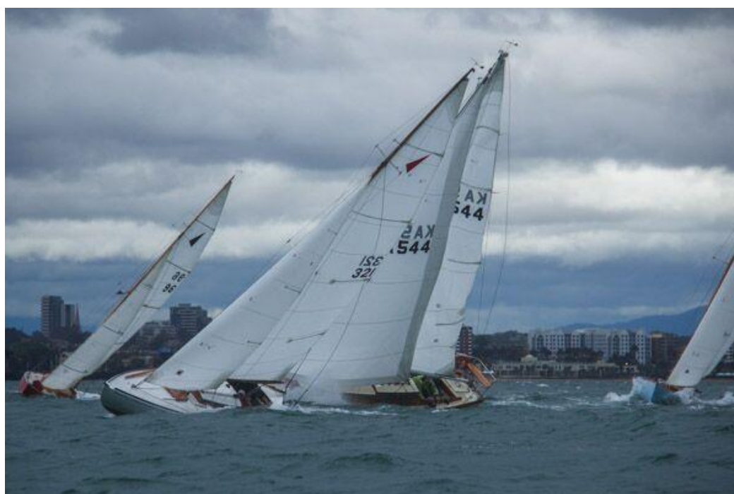
Tight action at the start line. Astrud and the Tumlaen Ettrick