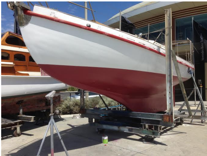
Scarlet in the Sandringham Yacht Club yard

design, the Eric Hiscock Wanderer IV design. This is the Eric Hiscock who arrived at SYC during one of his round the world epics and pronounced Port Phillip as no good for anything but racing. What would he know!