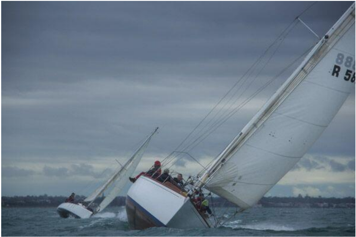
Cyan going well after the start with an eased main