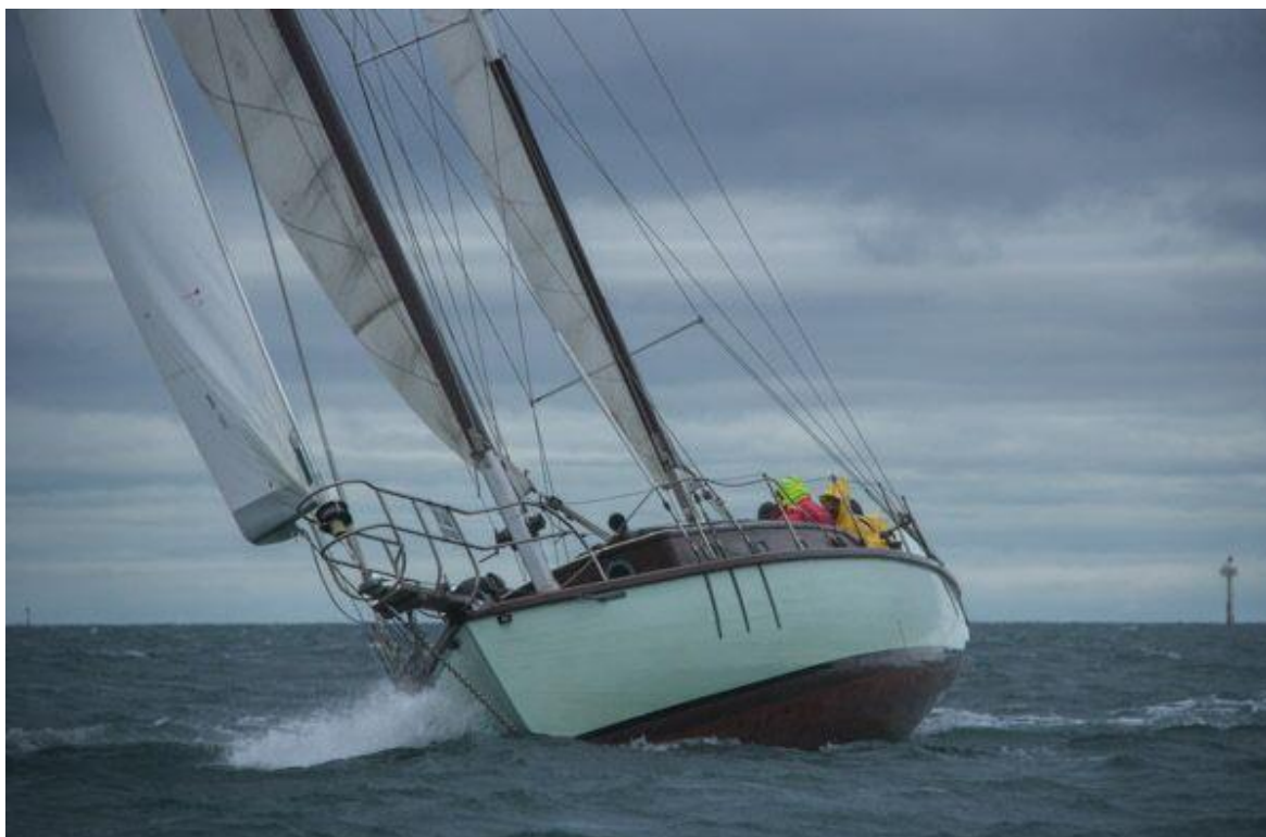
Blackadder Race 2 winner on corrected time