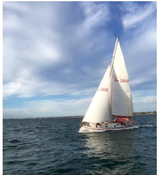
Scarlet under sail