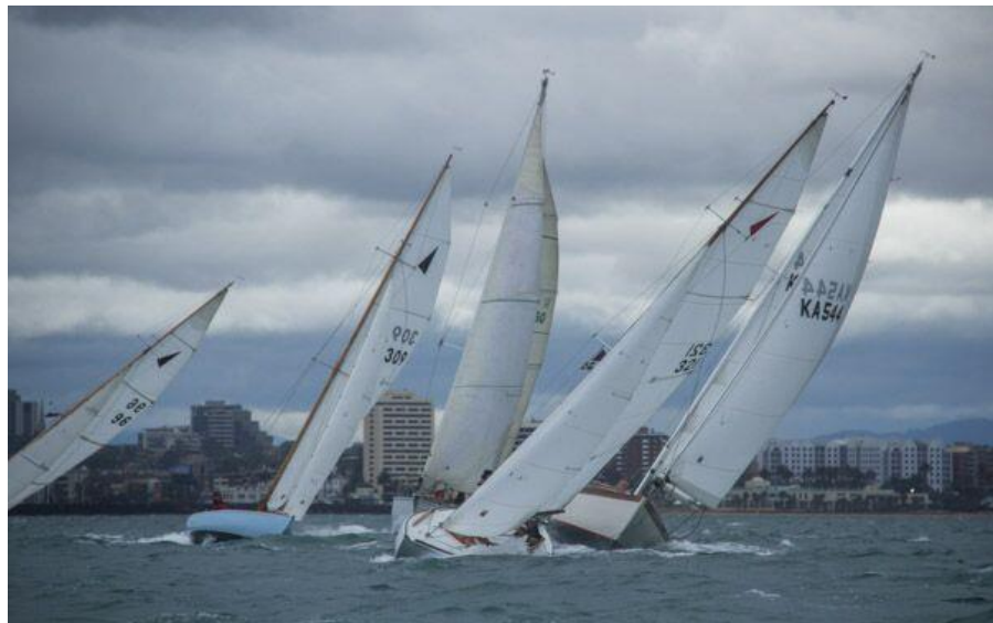
Tight Classic Yacht racing at the start of Race 2 Nov 13 2016

The same good practice comment, "don't push that margin for error envelope" applies to the overtaking boat. Take a look at the attached Race 2 photo. A wind flaw can easily put a mast truck well below the mast truck of an adjacent boat. Unhappy consequences if too close when a wind flaw hit's. Classic racing rules in the Med now require an overtaking boat to maintain a clearance of 3 boat lengths. Again being too close to a leeward fixed mark during a rounding when a wind flaw hits, especially if your topping lift is flying, can bring unfortunate consequences.