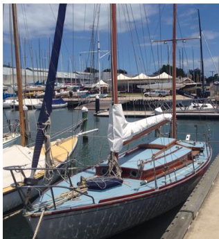
Huia after her refit

Welcome to the H28 Huia on her first race with the Classic fleet