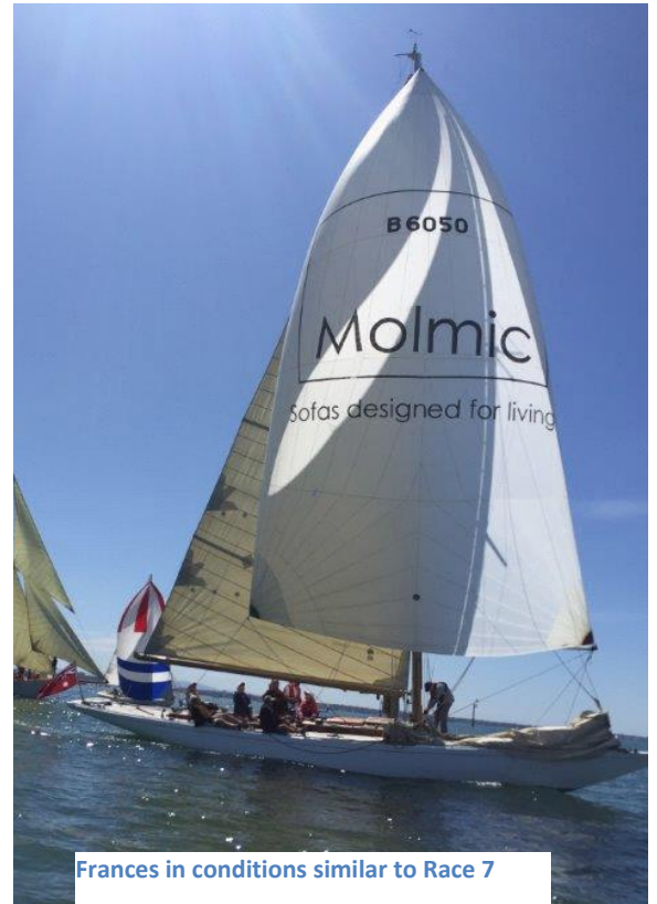
Frances in conditions similar to Race 7

Welcome to the H28 Huia on her first race with the Classic fleet