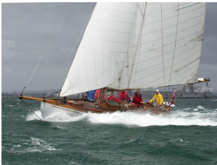
Windward II abeam Point Henry Corio Bay

To date entries have also been received from Warringa, Ettrick, Snow Goose, Fair Winds and Mercedes III . There's two weeks left to sort out and organise entries.